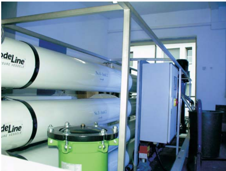
multistage high pressure pump