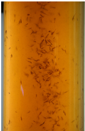
zooplankton tube with adult Artemia „salina“, fed with the diatom Phaeodactylum tricorutum

Order number phytoplankton tube: Pkt90-90