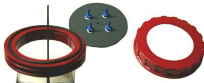
spare parts of the head