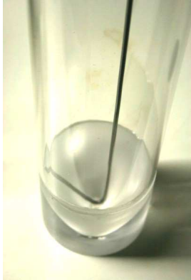
acrylic cylinder with cone and paddle scraper