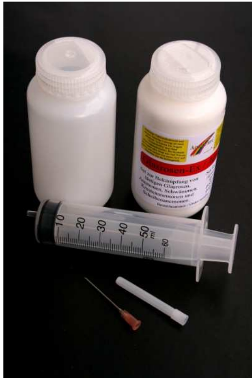
Aptasia-Ex : a set with mixing container, syringe with drain tube, calcium hydroxide powder and manual. order number: EX-001