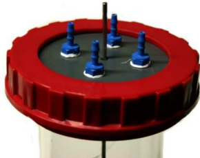
complete zooplankton head