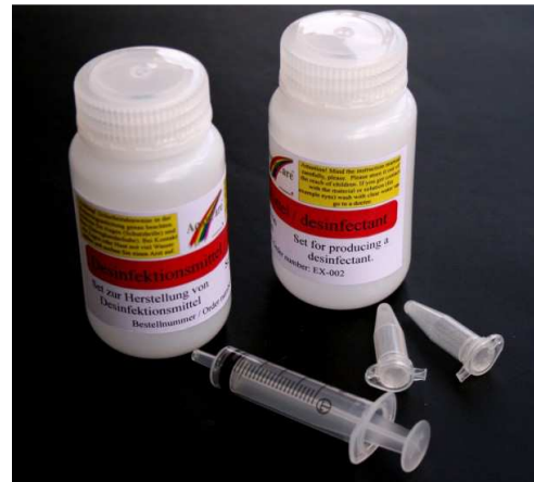
Set for producing 400 liters of disinfection solution consisting of: 2 × fluid component, 2 × powder component, 5 ml-Syringe, order numer EX-002

The AquaCare disinfecting solution is working with the chlorine dioxide method - do not mix up with chlorine gas or hypo-chloride method! Chlorine dioxide has the distinction of killing steady algae, bacteria, viruses, spores, fungi and protozoa. Chlorine dioxide has a 2.5 time larger oxidation power than per-acetic acid, hydrogen peroxide, sodium hypochlorite or gaseous chlorine. It is much more faster reacting than chlorine and is suitable in a wide pH range of 6.5 and 9.5. The deposit effect enables this chemical to destroy bio-film. Odorants like phenols and algae decomposition products will be oxidized. In contrast to the chlorine method the chlorine dioxide methods do not form halogenated substances like THM, chlorine phenols, AOX, chlorine amines: no reaction with primary, secondary and quaternary amines.