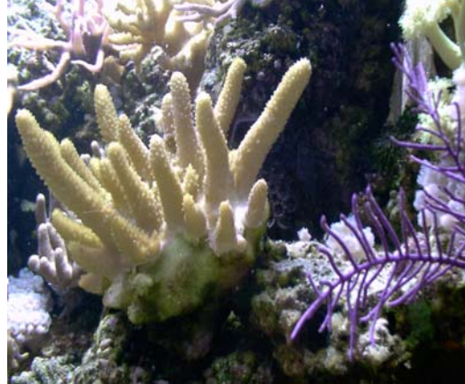
Cut of a AquaCare Aquarium

The more light is over the aquarium the more water will evaporate. If you do not refill with pure water (R.O. water) the salinity will rise with the time. To refill the water you have to take water with very low salt content to prevent a changing in the salt components. Best way is a continuous refilling with an automatic refill system like the AquaCare BasitTech . If you refill manually pump the water slowly to the aquarium. Otherwise an osmotic shock will occur. Please check the salinity every month. If the salinity is to high take a little bit sea water out of the tank and refill it with R.O. water. If the salinity is too low, fill fresh sea water to the tank. The evaporation will rise the salinity.