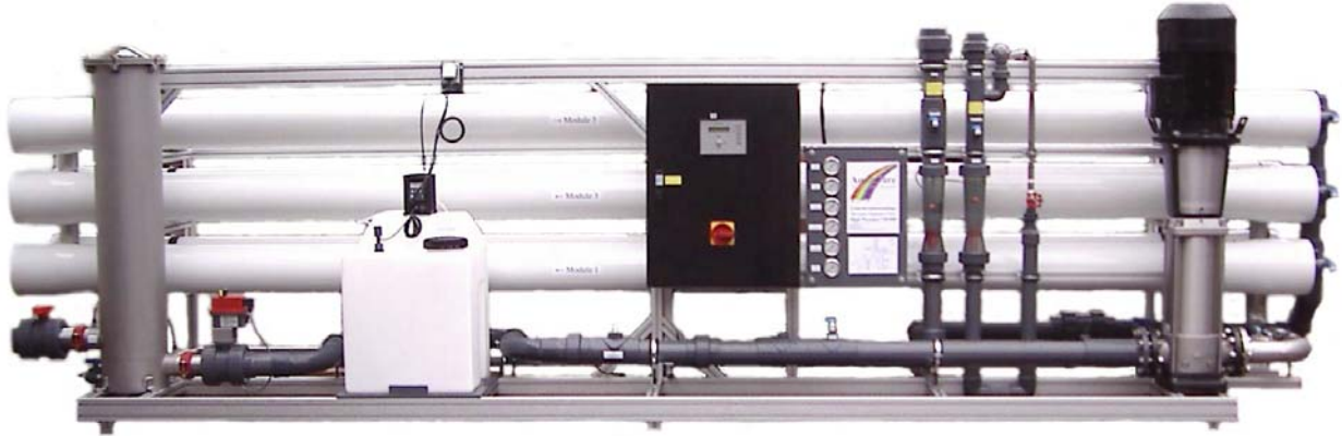
HP 720,000 (40 m 3 /h) with dosing station

AquaCare GmbH & Co. KG Am Wiesenbusch 11 • D-45966 Gladbeck • Germany ☎ 0 20 43 - 37 57 58-0 • 📠 0 20 43 - 37 57 58-90 www.aquacare.de • info@aquacare.de