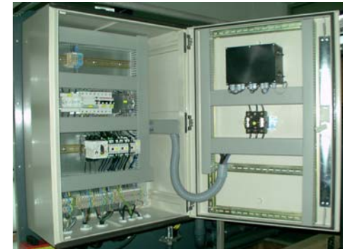
electric box with all necessary parts