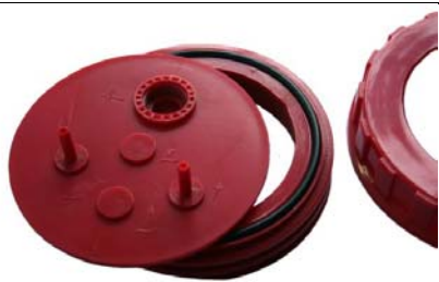
parts of the head