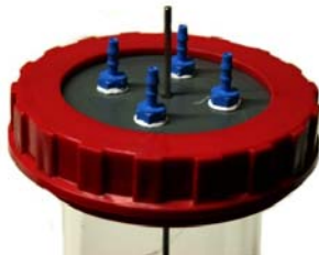
complete zooplankton tube head