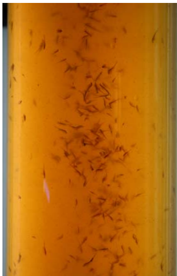
Zooplankton tube with adult Artemia „salina“ fed with the diatom Phaeodactylum tricornerutum

Extra long cleaning brush for e.g. plankton tubes Diameter: 30 mm Border length: 125 mm Total length: 900 mm Order number: Brst-001