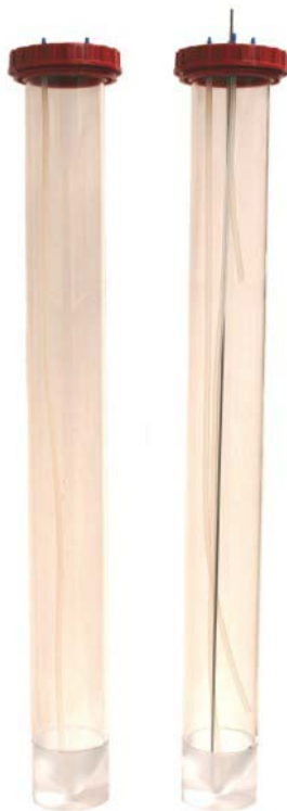
Phytoplankton and zooplankton tube

The zooplankton tube is equipped with additional connectors and a paddle scraper to remove detritus from the bottom cone. Afterwards it is possible to suck off the deposits by a hose.