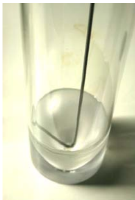
acrylic glass with cone and paddle scraper