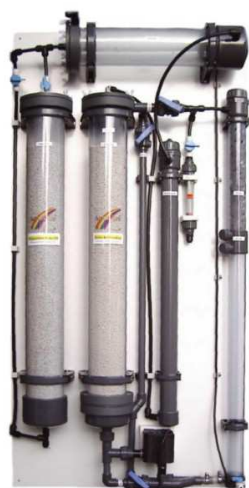
Special design: the Magnesium Tube (left tube) is mounted directly onto the mounting plate of the Turbo Chalk Reactor (not size 1)