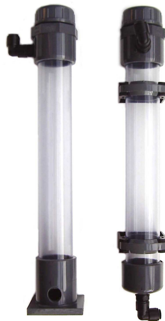
Magnesium Tube as sump version (left) and for wall mounting (right)

Turbo -magnesium should not be mixed with calcium material in the calcium reactor. The granules have different dissolving characteristics and magnesium can quickly accumulate too much. The aquarist is unable to control the performance of the two granules in a mixing system. It is better to install an additional column behind the lime reactor (traditional system or Turbo chalk reactor) and fill it with Turbo -magnesium. Once the optimum magnesium concentration in the aquarium water has been achieved, the column can be easily removed and the lime reactor continues to work on its own. The power of the downstream magnesium column can be roughly regulated with the filling quantity. The more granules used, the higher the performance. It should be noted that fresh Turbo -magnesium granules have a higher performance than those already in use. The Turbo -magnesium may only be filled directly into the calcium reactor if the magnesium requirement is very high.