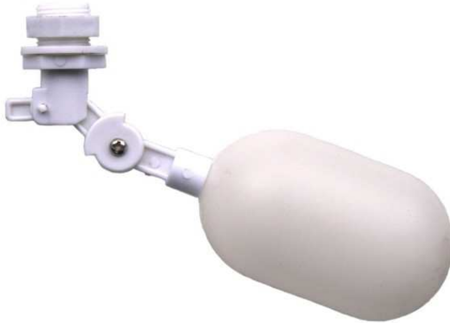
Plastic floating valve with vertical attachment and adjustable float

AquaCare GmbH & Co. KG Am Wiesenbusch 11 • D-45966 Gladbeck • Germany ☎ 0 20 43 - 37 57 58-0 • 📠 0 20 43 - 37 57 58-90 www.aquacare.de • info@aquacare.de