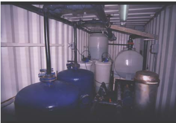
pre filtration in a container