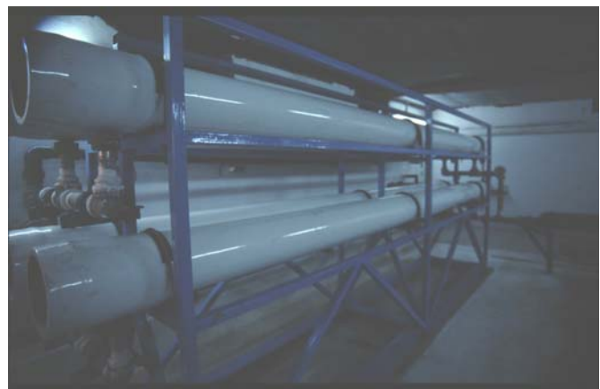
high pressure R.O. module housings