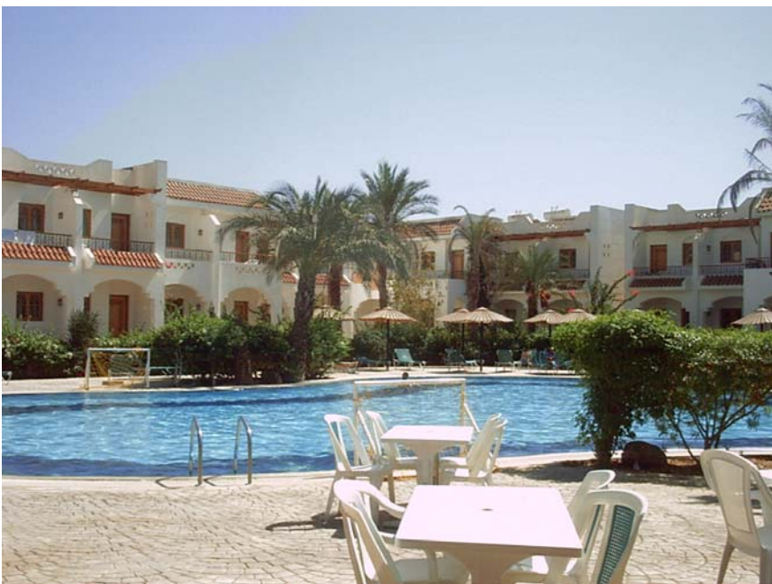
hotels at the Red Sea needs a lot of fresh water

location: .....Egypt, Red Sea, Hurghada branch of customer: .....hotel type of AquaCare unit: .....SW 250.000 capacity:.....250 t/d – 10.4 m 3 /h at 25°C water quality: .....sea water: 40,000 mg/l TDS