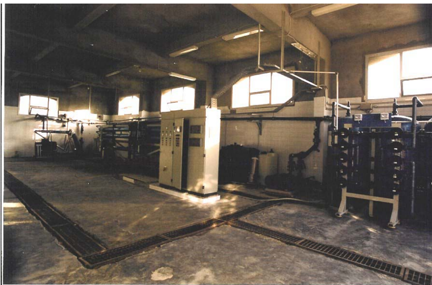
total view of the system:

location: .....Egypt, Red Sea, Port Safaga branch of customer: .....water production for bottled water type of AquaCare unit: .....SW 500 with energy recovery turbine capacity:.....500 t/d – 20.8 m 3 /h at 25°C water quality: .....sea water: 42,000 mg/l TDS